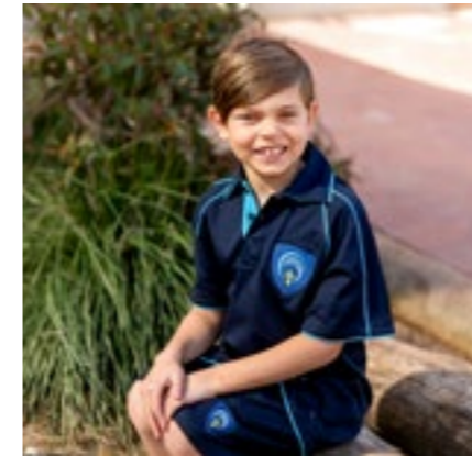
The popular short sleeve polo shirt combined with shorts .