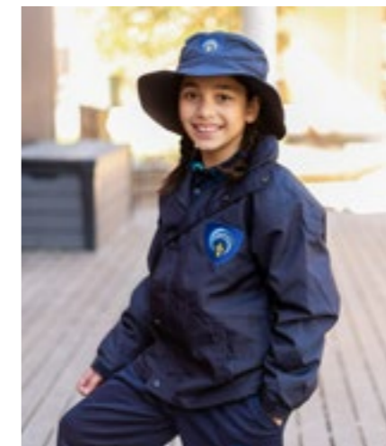
There is a choice of two optional jackets as voted by parents; the softer style water resistant wet weather jacket (above left) lined with lightweight micro polar fleece or the shorter style water repellent stadium jacket (above right). Featuring a thick polar fleece lining, this style is more popular with older children. Both jackets have hideaway hoods for rainy days.

There is a requirement to wear predominantly white sport shoes with white laces and we recommend The Athlete's Foot at Marion to supply our families with a professional shoe fitting service for a choice of Asics, Ascent and New Balance that meet our uniform policy.